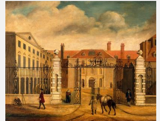
Bottom row of images courtesy of Wellcome Images