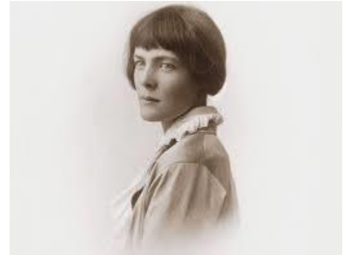
HD (Hilda Doolittle)