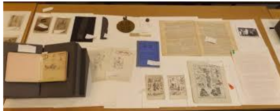
Liddle Collection Special Collections University of Leeds