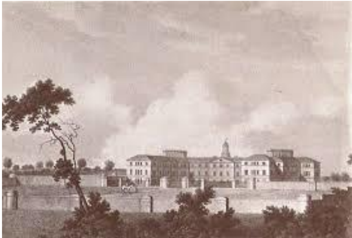
West Riding Asylum, Wakefield