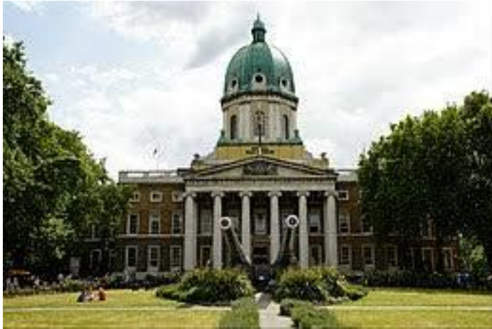
Imperial War Museum London