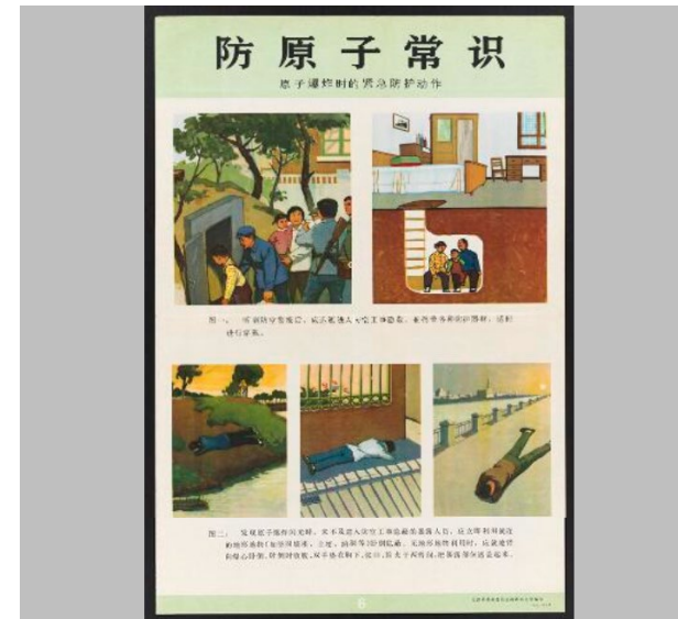
Nuclear self help