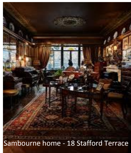
Sambourne home - 18 Stafford Terrace

We begin with a private guided tour of 18 Stafford Terrace , the home of Punch cartoonist, Edward Linley Sambourne . Preserved as in 1899, the house gives an insight into Sambourne's working methods and the family's social prominence among the Victorian literati, including Oscar Wilde. The 'Aesthetic interior' or 'House Beautiful' style, advocating foreign or 'exotic' influences is much apparent in this much-loved family home.