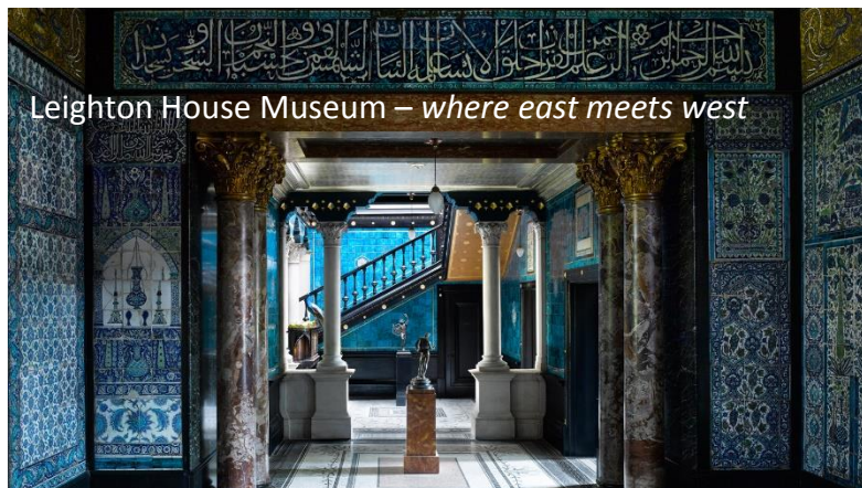
Leighton House Museum – where east meets west