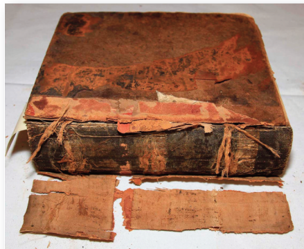
Pharmacopoeia Collegii Regalis Medicorum Londinensis (Royal College of the Physicians of London Pharmacopoeia) Dated 1809. This was the Society's Laboratory copy.

Donations can be recorded on an inscription plate with or in the chosen book, and a dedication may be made on a sole funded project. Books that have received a new lease of life as a result of donations from the scheme will be displayed at a suitable Society event.